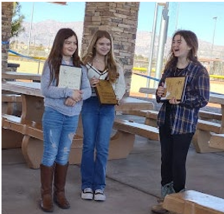
2023 NSHA V Youth Horsemanship Awardees – Sharing, Caring and Growing.

NSHA YHIP Worksheets filled out and submitted to Advisor as page is completed, then start new worksheet and submit as completed. Worksheets can be found on website Youth page.