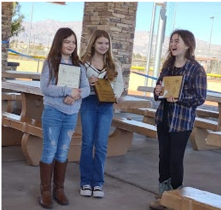
2023 NSHA V Youth Horsemanship Awardees – Sharing, Caring and Growing.

NSHA YHIP Worksheets filled out and submitted to Advisor as page is completed, then start new worksheet and submit as completed. Worksheets can be found on TBD website Youth page.