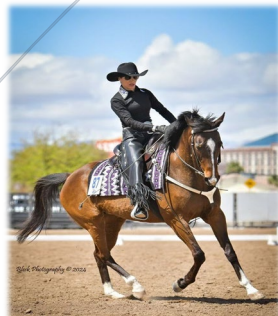
Angel Bea Thelma Kill Pen Rescue