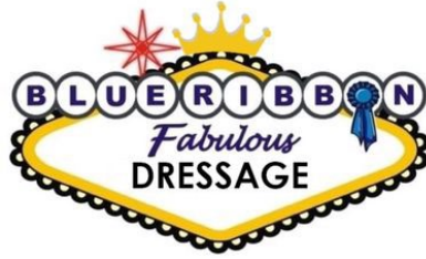
Blue Ribbon Dressage & Annette Spinetti Silver Sponsor SSWD & H4H Season Show Open Division Show High Scores 1 st through 6 th Place Ribbons