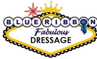
Blue Ribbon Dressage & Annette Spinetti Silver Sponsor SSWD & H4H Season Show Open Division Show High Scores 1 st through 6 th Place Ribbons