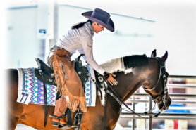
Skies The Limitt Owner Rescue