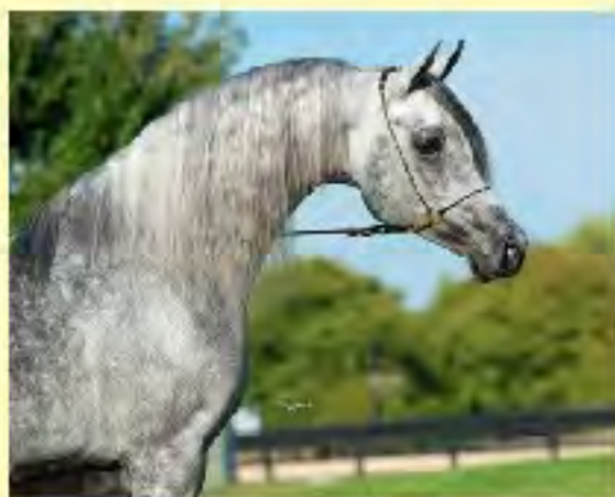
Standing at Stud: DE Luca IMA (Ali RA IMA x Midnight Valentine) SHN TT Stallion and Regional Champion