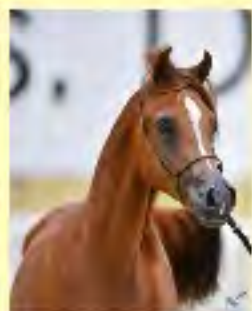
Encore MIRA Entri HA x SC Harmony 2022 colt Sweepstakes SHN TT Yearling