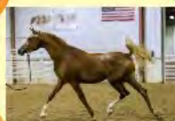
Tsoul LC Psy vibration x IMI Society Belle 2020 Stallion Sweepstakes USN TT Colt